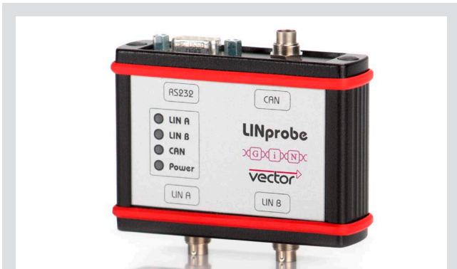
LINprobe External extension for up to 10 LIN channels For all GL loggers