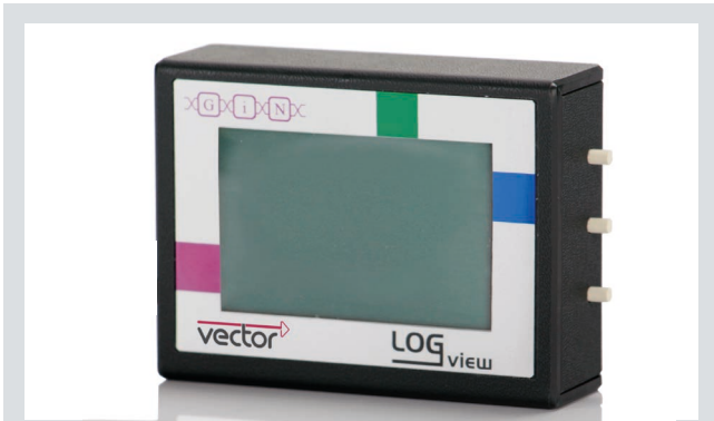
LOGview Display of textual and graphical information For all GL loggers