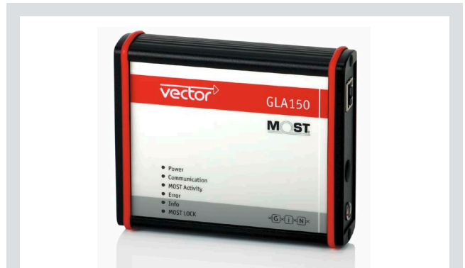
GLA150 Time-synchronous logging of MOST150 data For GL3000/GL4000 family