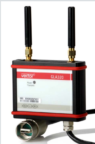
GLA320 Modem for wireless data transfer via 3G/UMTS For GL3000/GL4000 family, for GL2000 family an alternative module is available

Comprehensive Data Logger Accessories for the GL Logger Family