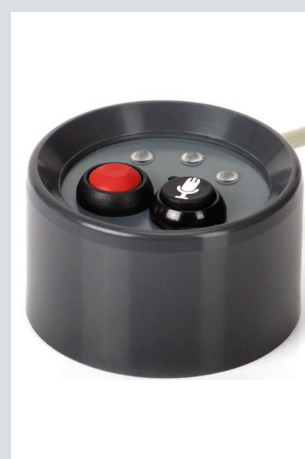
CASM2T3L Voice recorder for logging of user comments on specific events suitable for vehicle cup holders For GL2000/GL3000/GL4000 family