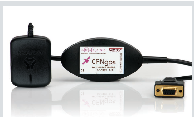
CANgps Logging of vehicle position via GPS For all GL loggers, for GL2000 family an alternative module is available