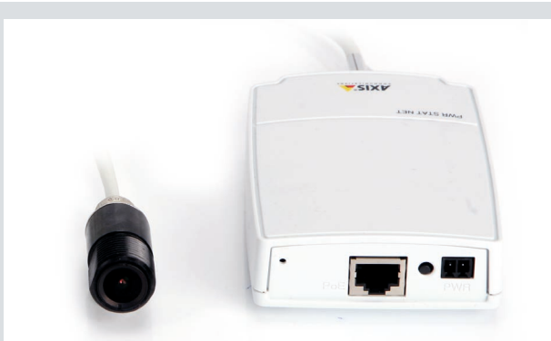
HostCAM Digital camera for high-quality color photos For GL3000/GL4000 family