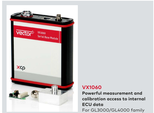
VX1060 Powerful measurement and calibration access to internal ECU data For GL3000/GL4000 family