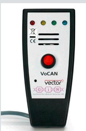
VoCAN Voice recorder to log user comments as well as voice output on specific events For GL2000/GL3000/GL4000 family